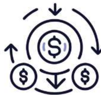
Financial Sustainability Sporting Events, and Marketing (10 ECTS)